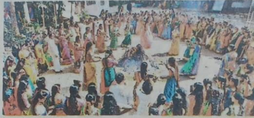
భోగి మంట చుట్టూ కోలాటం వేస్తున్న విద్యార్థులు