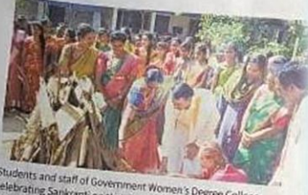
Students and staff of Government Women's Degree College celebrating Sankranti on their campus in Madanapalle, Annamayya district, on Thursday.